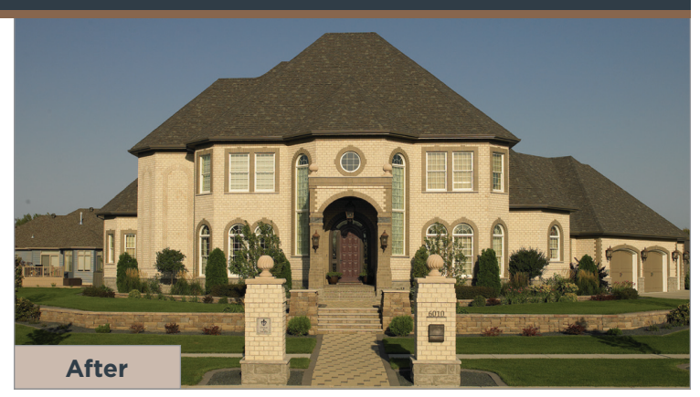
The well-researched landscape plan is not only faithful to French design but is equal in scale and grandeur to the home.

the Highland Stone<sup>®</sup> products in a color complementary to the home that's not normally available in his market (it was shipped from South Dakota) and recommended limestone balusters and one-of-a-kind limestone steps.