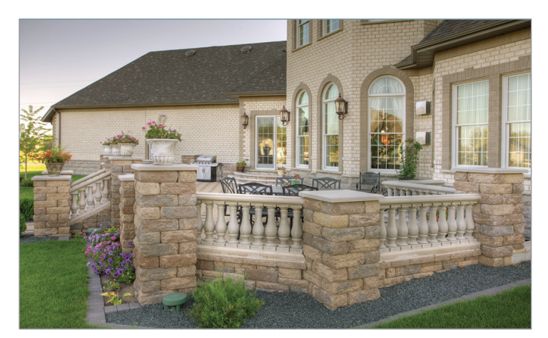
Completing the details of the raised courtyard took more than two weeks and required integrating the balusters and horizontal railings into the Highland Stone<sup>®</sup> system.

The backyard features a spacious raised patio, which the homeowner refers to as a courtyard. Lahren and his crew employed their meticulous craftsmanship as they installed the limestone railings and each of the 110 balusters. Lahren likes to think that every job requires a new skill. For the courtyard, the crew used a Dremel tool outfitted with a diamond tip to cut into the Highland Stone® column units for perfect integration with the horizontal railings. Each baluster was drilled to hold a fiberglass dowel and glued