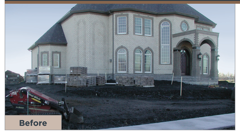
The authentic French design of this new home demanded an equally genuine landscape plan.